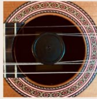
Expert Luthier Advice on How to Humidify a Guitar