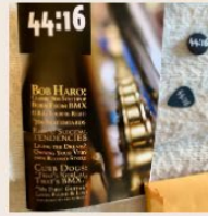
Julia Featured in 44:16 Zine