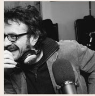
My First Guitar mentioned in Marc Maron's Podcast